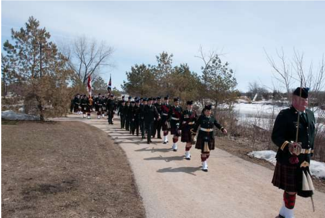
Cameron Cadet 100 th

Here are a few pictures of the Freedom of the City Parade on 20 April 2013 starting out at The Scottish Monument: